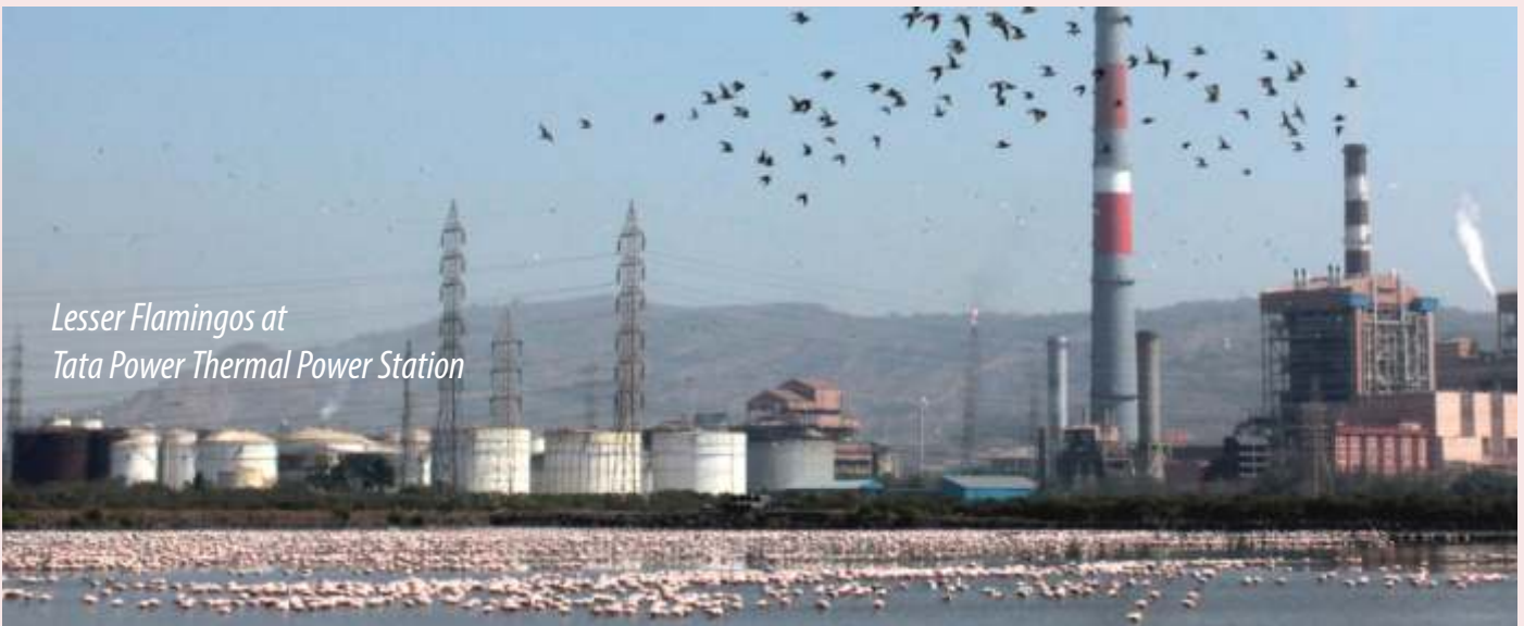
Lesser Flamingos at Tata Power Thermal Power Station

Tata Power's Bund welcomes flamingoes from Kutch every winter