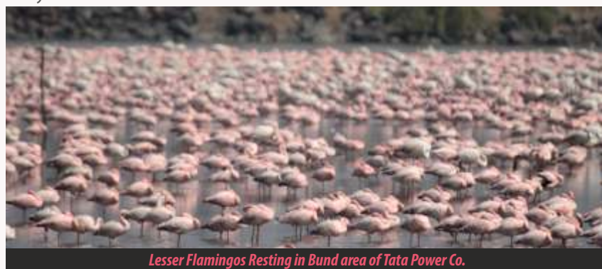
Lesser Flamingos Resting in Bund area of Tata Power Co.

The flamingoes can be seen in the Bund are from November to May when they fly in from Rann of Kutch, where they have their breeding grounds. Although most flamingoes stay till May, there are exceptions when it comes to a few individual flamingoes. In some cases, they might be injured or unfit to fly back.