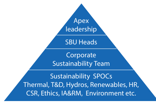
Fig. Sustainability Governance Structure

a. Indicate the frequency with which the Board of Directors, Committee of the Board or CEO to assess the BR performance of the Company. Within 3 months, 3-6 months, Annually, More than 1 year. Sustainability performance at Tata Power represents a long-standing Board agenda, consistently monitored by the Board CSR Committee and Apex Leadership. With established quarterly meetings, the CSR committee also recommends the activities to be undertaken by the Company as specified in Schedule VII to the Act or prescribed by the rules.