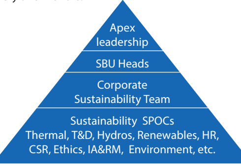
Fig. Sustainability Governance Structure

Indicate the frequency with which the Board of Directors, Committee of the Board or CEO assess the BR performance of the Company. Within 3 months, 3-6 months, Annually, More than 1 year. Sustainability performance at Tata Power represents a long-standing Board agenda, consistently monitored by the CSR Committee and Apex Leadership. With established quarterly meetings, CSR Committee also recommends the activities to be undertaken by the Company as specified in Schedule VII to the Act or prescribed by the rules. The CEO & Managing Director reviews the sustainability performance of Tata Power once every two months.