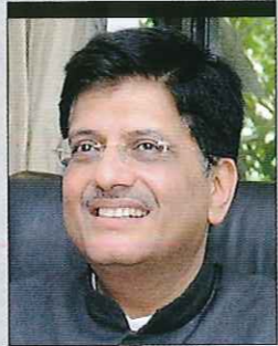
Piyush Goyal For the increase in coal production, UDAY and the 100 GW solar initiative. For changing the sector dynamics.