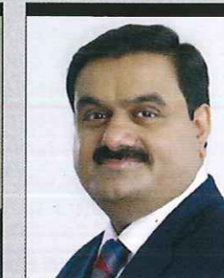
Gautam Adani For building a truly integrated energy business. For taking the risk and going against the tide.