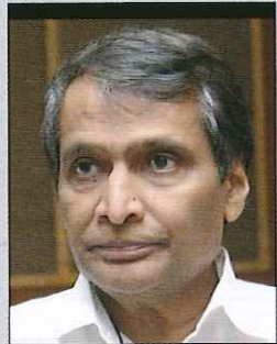
Suresh Prabhu For pushing major reforms through, including the Electricity Act. For getting the MoP and CEA out of the way of most private projects.