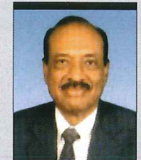
R.K. Narayan For laying the ground work and building the foundation of transmission infrastructure.