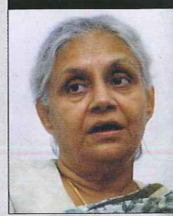
Sheila Dikshit For having the political courage to stick with the Delhi privatisation of distribution.