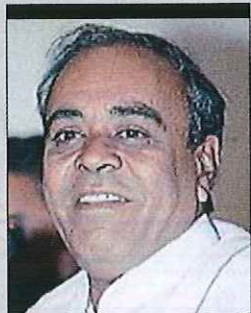
P.R. Kumaramangalam For kick-starting the reforms, though he passed away before he could see them through.