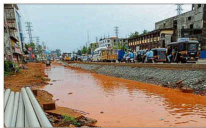
Rainwater accumulates at National Highway widening site near Ranginakatta in Bhatkal of Uttara Kannada district.