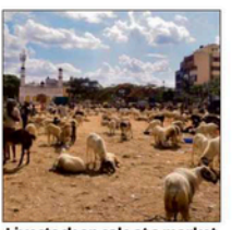
Livestock on sale at a market in Chamaraajpet.