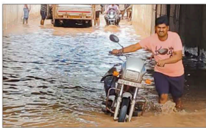
A railway underpass near Kurekappa in Torangal hobli of Ballari district is flooded following heavy rains on Saturday night.

"The chief minister (C. Joseph Vijay) should strongly condemn the deputy chief minister for his remarks on (Tamil Nadu's) rights over Cauvery river... he should thwart efforts to construct the dam in the initial phase itself," the DMK leader demanded.