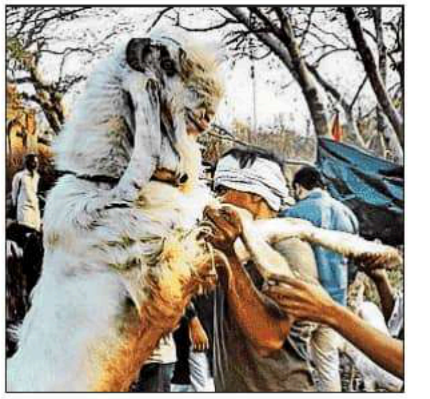
A vendor holds a goat on sale at a livestock market in Bhopal

Bhopal: Bucks, bling and bidding was before Bakrid — GOAT season has hit Bhopal. Greatest Of All Time? Try goats lowered by crane onto floodlit stages, draped in garlands, hoisted on hydraulic platforms. Crowds crane necks. Phones rise like pasture grass in monsoon. Fifteen days before Eid-ul-Azha (May 27-28), the Madhya Pradesh capital turns livestock into live spectacle. Wealthy buyers fly in from Mumbai and New Delhi for a glimpse of bucks worth several lakhs of rupees. Months earlier, breeders quietly separate a handful of kids from hundreds at farms across Bhopal. Chosen for glossy coats, long ears and broad frames, mostly from Kota and Jannapuri bloodlines, they are raised like thoroughbreds headed for a championship ring. "They can grow to 110cm