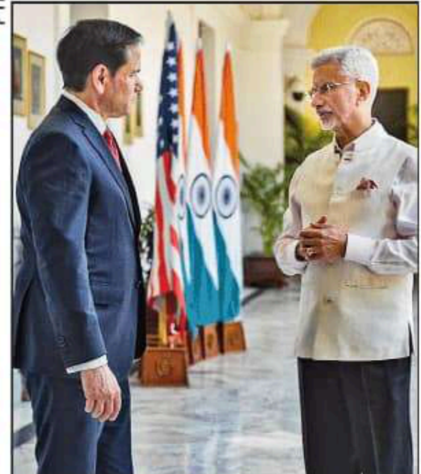
Rubio said India, US were 'aligned on all major global challenges'

Rubio said, notwithstanding the challenges faced by legitimate travelers because of visa-related issues, linking it with the health of business, technology and research cooperation. The minister said while the two sides were cooperating to deal with illegal and irregular mobility, India's expectation is that legal mobility would not be adversely impacted as a consequence.